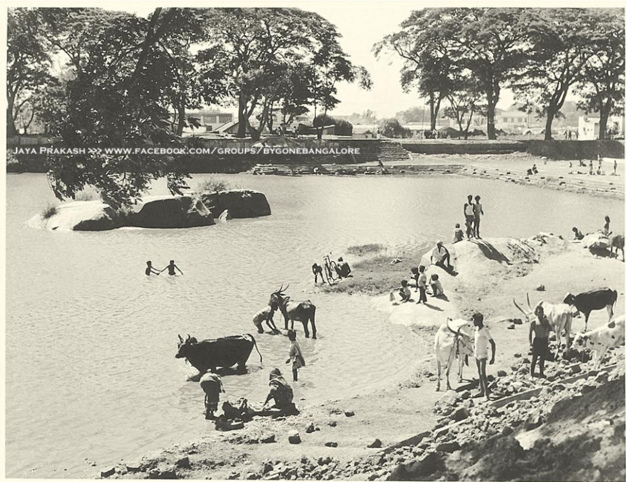
Fig. 4. Cows being washed in Sampangi Lake