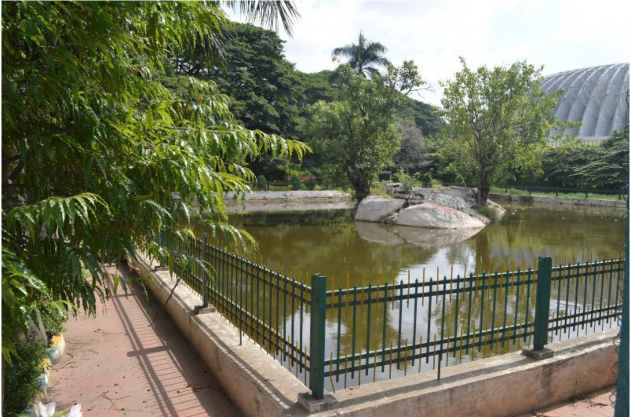
Fig. 1. The small remnant water body of today overshadowed by the distinctive dome of the Sri Kanteerava Stadium