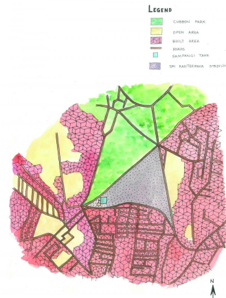
Fig. 3. Map of Sampangi lake and its surroundings in the year 2014

This work is used by permission of the copyright holder.