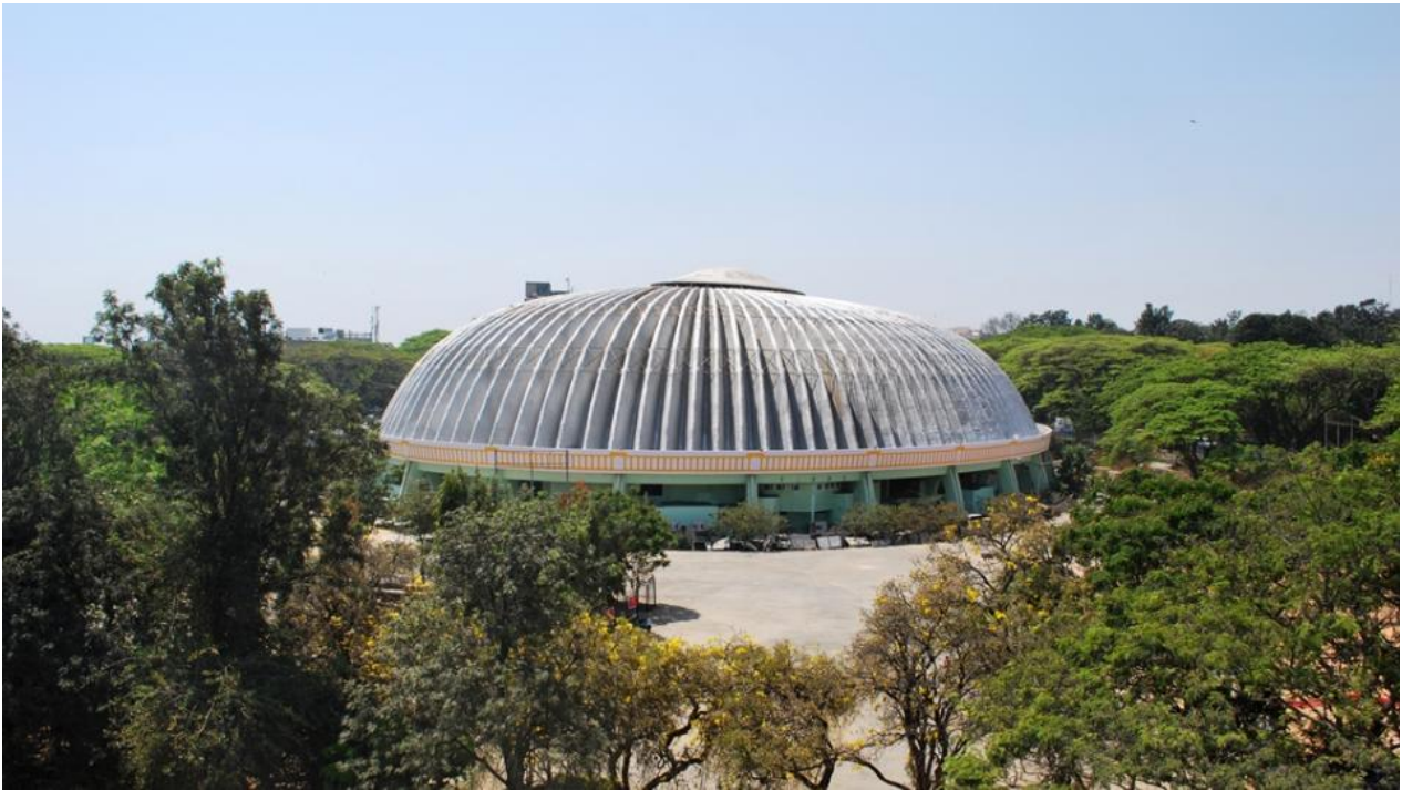
Fig. 5. Sri Kanteerava Indoor Stadium in 2012

perceived as a hazard to life (on account of incidents of drowning), and a health hazard. Urbanization, increase in land prices, and a change in perception of the utility of the lake catalyzed its conversion into a built-up space. As Bangalore grew into a twentieth-century city with an aspirational modern identity, the lakebed was converted into the Sri Kanteerava indoor sports stadium. The landscape around Sampangi now retains little of its former ecological and social importance. Only the small rectangular tank of water remains, because of its centrality to the Karaga festival.